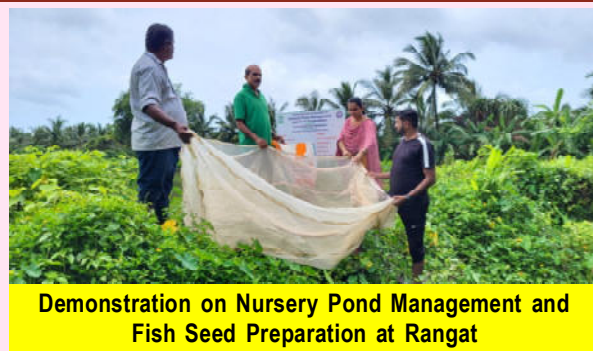
Demonstration on Nursery Pond Management and Fish Seed Preparation at Rangat

To promote scientific and sustainable farming, the Union Territory Agriculture Technology Management Agency (UTATMA), in collaboration with the Department of Agriculture, Andaman and Nicobar Administration, is conducting Training, Demonstration, and Farm School activities across various blocks of the Andaman and Nicobar Islands. These programmes aim to build farmers'